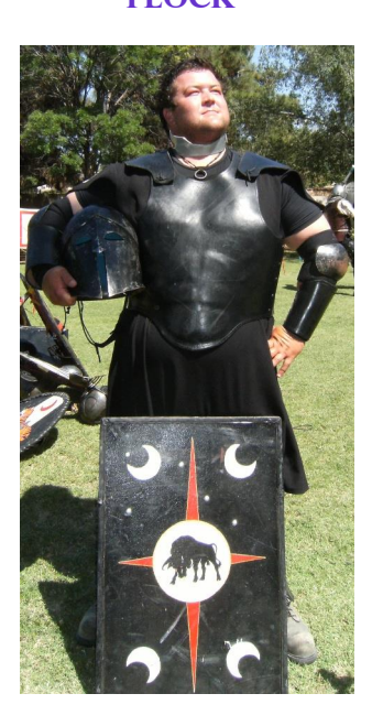
LORD RAYNOR BOLEHEUED